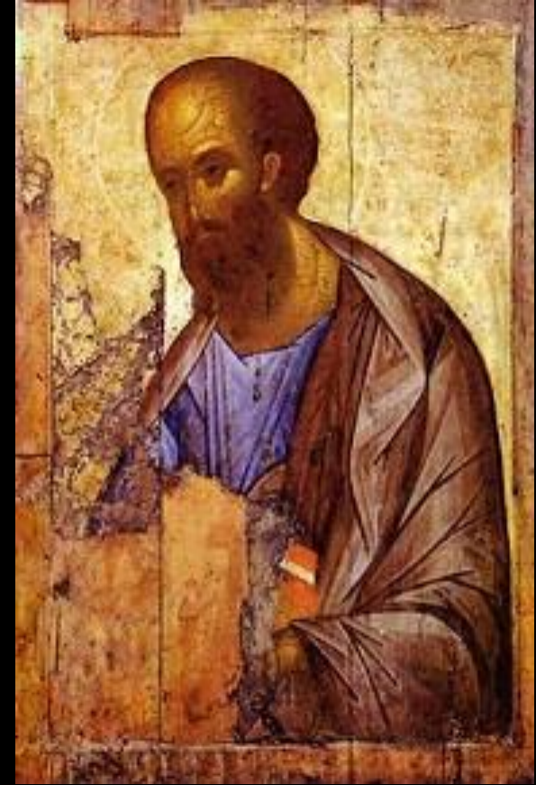
Apostle Paul (~ 5 – 67 A.D.) By Andrei Rublev (1410)