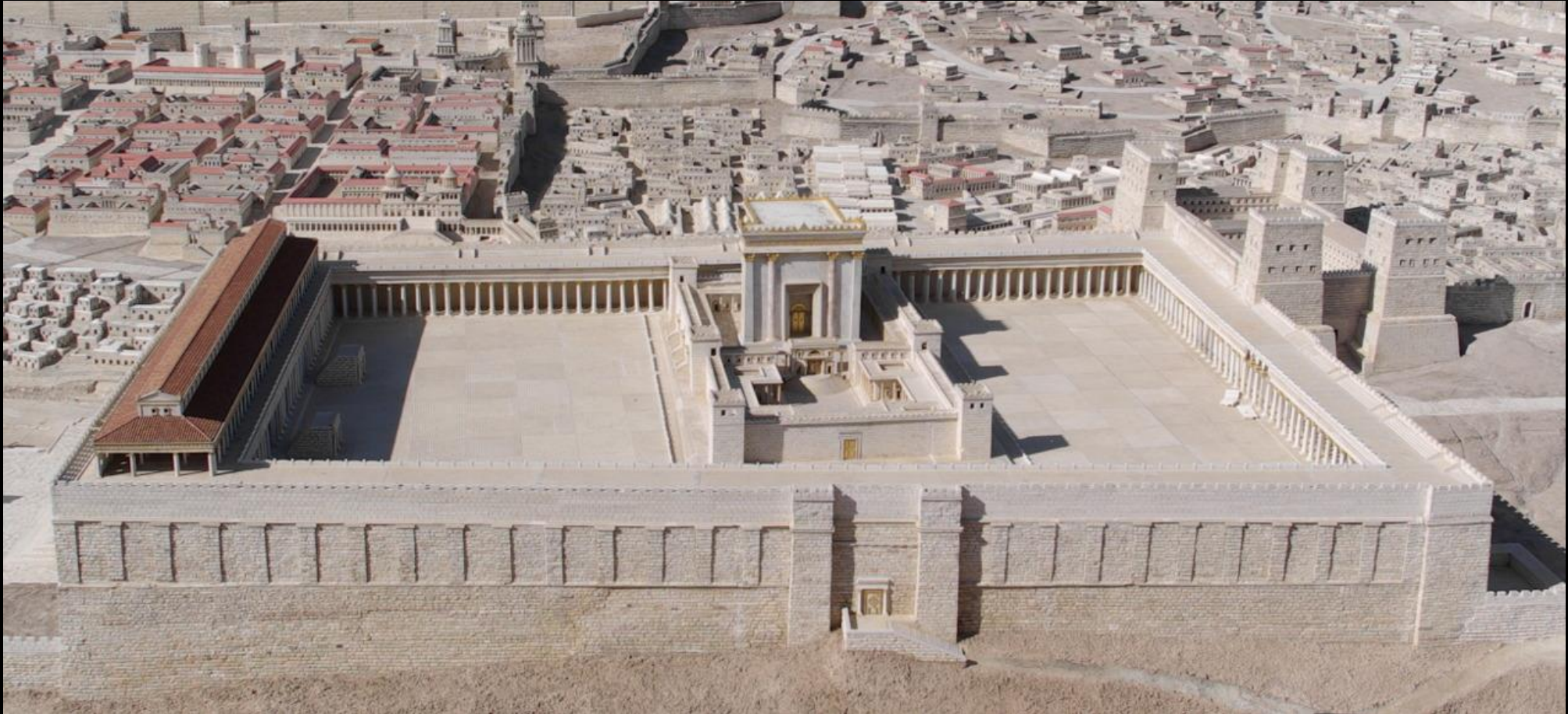
Second Temple Model 1