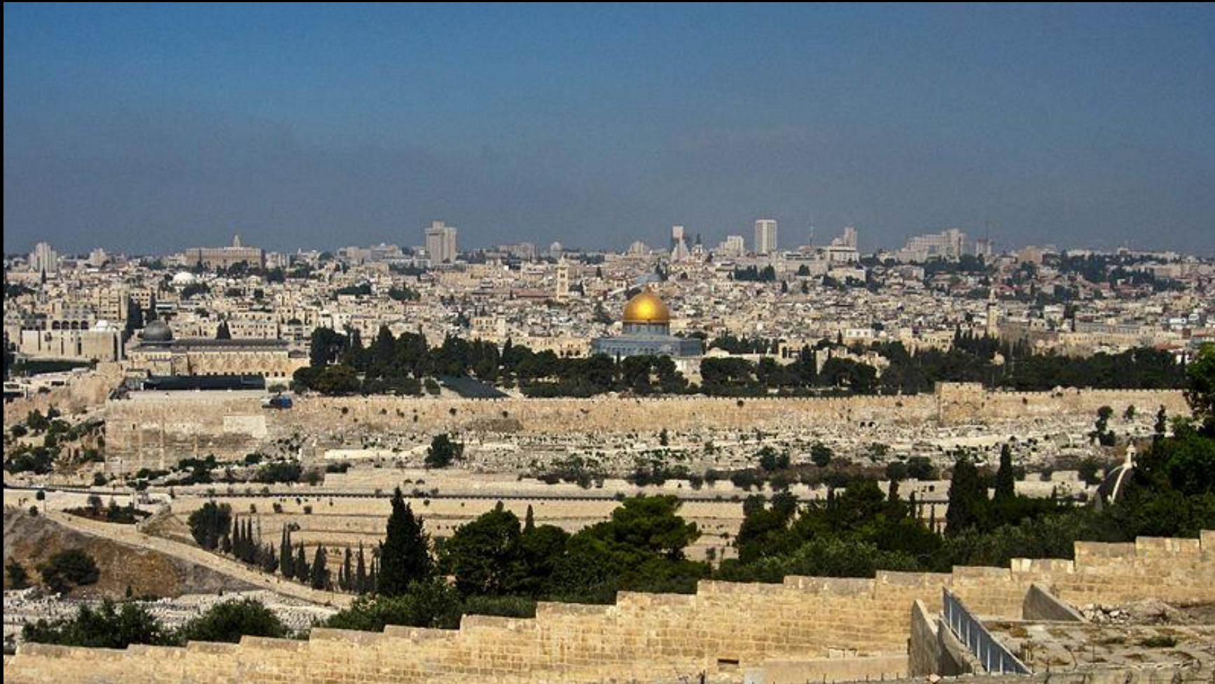
Jerusalem from the Mt. of Olives 2